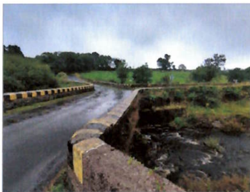
Figure 7 - Bridge C6 towards Dungarvan Substation

This route also passes through Scart Bridge, pictured below.